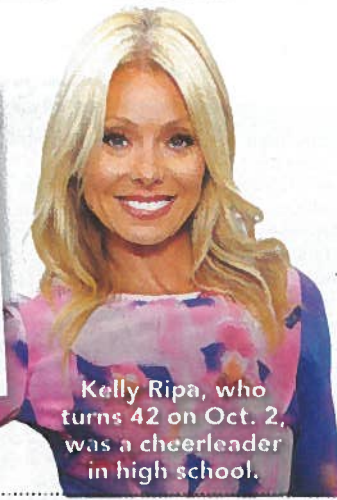
Kelly Ripa, who turns 42 on Oct. 2, was a cheerleader in high school.

Money: Working longer hours will result in a reward.